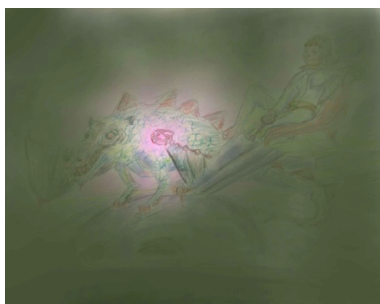
Impression of the counter-seraph in the earth’s kernel

The only one missing in this ranking is the 9 th sublittoral sphere. The Earth’s kernel in which is imprisoned a dragon in pure hate. He however is being tamed by Mother Earth in the stature of Isis Sophia. He is an elaboration of the antichrist, who wants to split our ego, our spirit germ, so that his creatures the asura’s, fire demons, can dwell in the spirit splinters and through their incarnations can free him. I suspect that you can compare to him Enlil, who only considered the Earth as a milk cow and man as a diminutive being, whom he treated cruel at will. He has been killed recently.